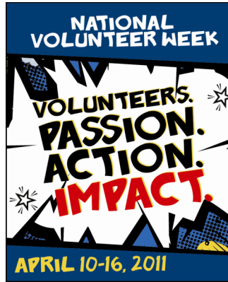
National Volunteer Week is April 10-16, 2011