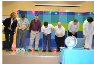
Members of the Man to Man Club perform on stage

to create this unique show and their efforts were well rewarded with a memory to last a lifetime.